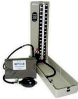
Blood Pressure Monitors